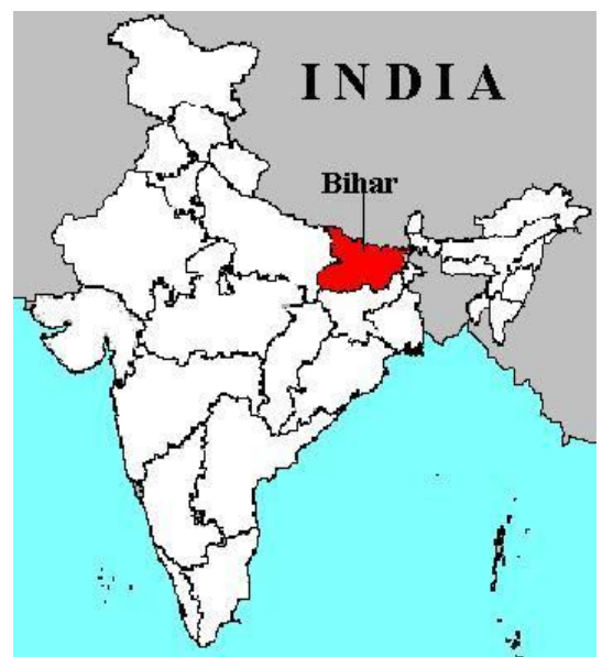
State of Bihar within India

the third most populous state in India being home to 104 million people, which makes it larger than most of the countries of the world. Bihar is one of the poorest and least developed states of India in terms of most of the development indicators - per capita income, various health and educational indicators, industrial and agricultural activities etc. However, for past 6 years, Bihar has been growing at a rapid rate under the new government, achieving a per annum growth rate of 12%, making it the fastest growing state in India. Further, Bihar has a very rich cultural and historical heritage, spanning more than 3000 years, being the birth place of Lord Buddha and King Ashoka and home to arguably the first republic in the world.